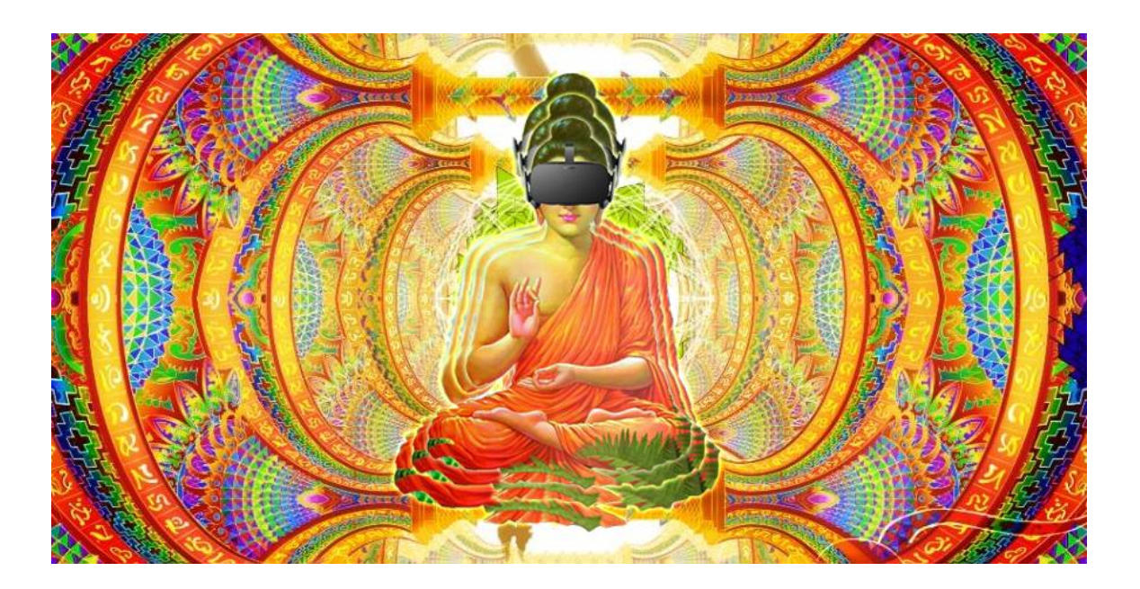
Figure 1: Can we make the benevolent exploration of the state-space of consciousness evolutionarily advantageous?

In conclusion, to close down hell (to the extent that is physically possible), we need to take advantage of the resources and opportunities granted to us by merely living in Hanson's "dream time" ( cf. Age of Spandrels [47]). This includes the fact that right now people are willing to spend money on new experiences (especially if novel and containing positive valence), and the fact that philosophy of personal identity can still persuade people to work towards the wellbeing of all sentient beings. In particular, scientifically-grounded arguments in favor of both Open and Empty Individualism weaken people's sense of self and make them more receptive to care about others, regardless of their genetic relatedness. On its natural course, however, this tendency may ultimately be removed by natural selection: if those who are immune to philosophy are more likely to maximize their inclusive fitness, humanity may devolve into philosophical deafness . The solution here is to identify the ways in which philosophical clarity can help us overcome coordination problems, highlight natural ethical Schelling points [27], and ultimately allow us to summon a benevolent super-organism to carry forward the abolition of as much suffering as is physically possible [42].